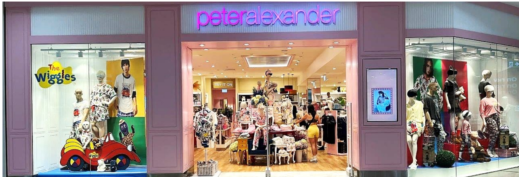
Cairns (QLD) – relocated and expanded July 2025