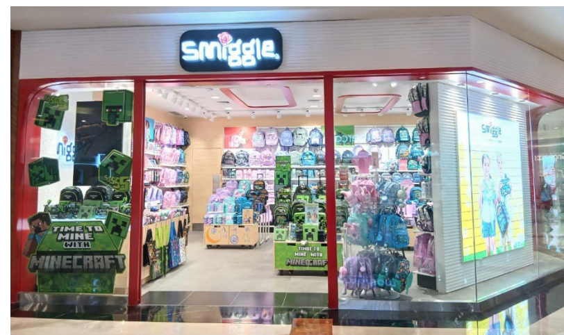
Pondok Indah Mall, Jakarta Indonesia – opened March 2025