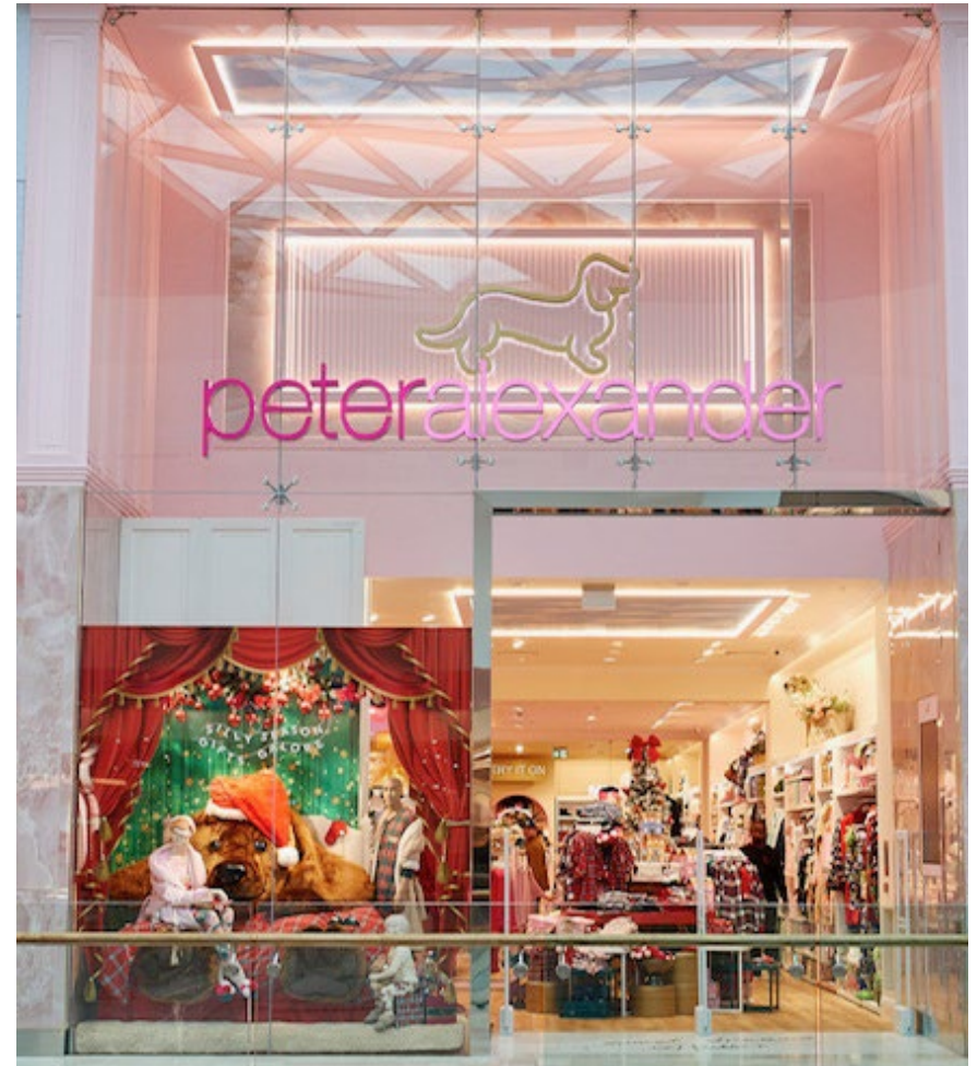
Peter Alexander: First UK store Westfield London Opened November 2024